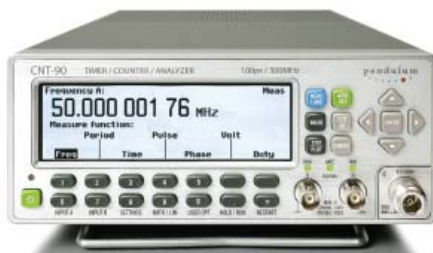
Figure 2: Measure function selection menu, shown with measured results.