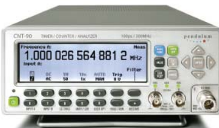
Figure 3: Input parameter setting menu shown with measured result.