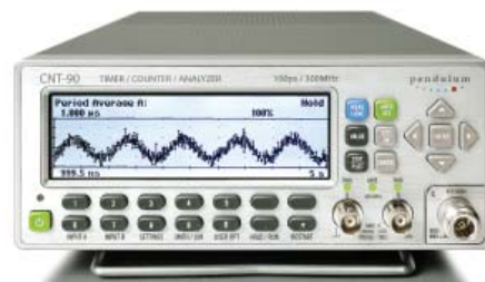
Figure 5: Display showing the trend (signal over time) of sampled data.