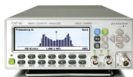
Figure 6: The same result as in Figure 5, now displayed as a histogram.