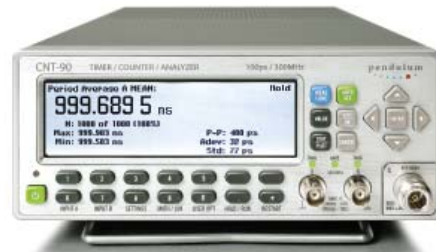
Figure 4: Display showing different statistical parameters viewed at the same time.