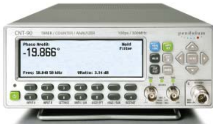
Figure 1: Display showing phase value, frequency, attenuation Va/Vb, and auxiliary parameters.

When adjusting a frequency source to given limits, the graphic display gives fast and accurate visual calibration guidance.